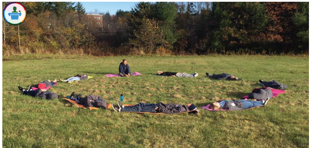
A Friends Forever alumnus leading a meditation workshop for a team from this year's Northern Irish program.