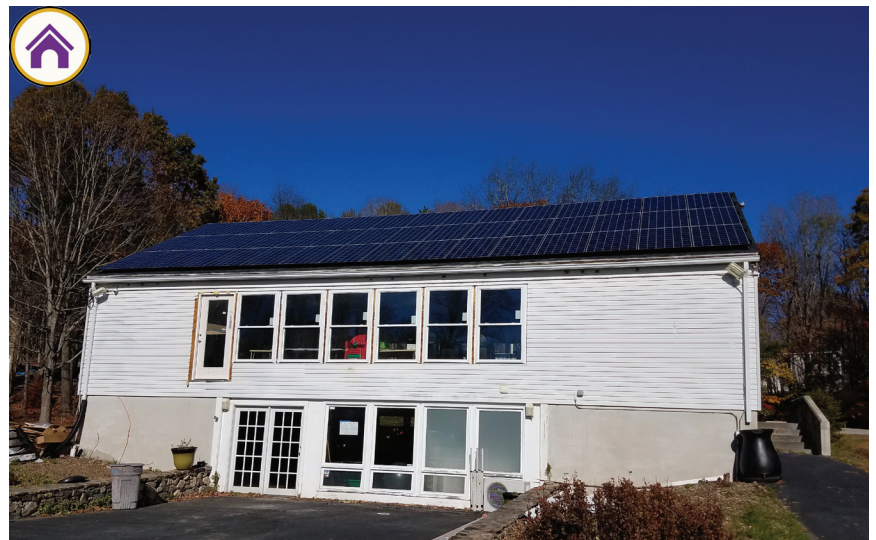
Friends Forever HQ now has an array of 45 solar panels! To learn more about the panels and other renovations in process check out our Capital Campaign page at www.friendsforeverusa.org/capital-campaign .